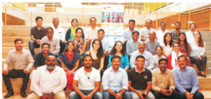
SEED Trainees and Trainers at Deshpande Startups, Hubli