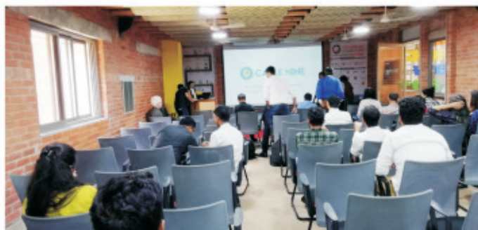
Budding Entrepreneurs Pitching their Business Ideas to the Panel of Judges at Deshpande Startups, Hubli

Three days TOT (Training of Trainers) workshop was conducted by SEED BDS+ TEAM from Germany in collaboration with Sandbox start-ups on 17, 18 and 19 Sep, 2019. Various Business tools which can be used in incubation centres were taught in interactive sessions. The training was attended by Team KRISHIK-ABI.