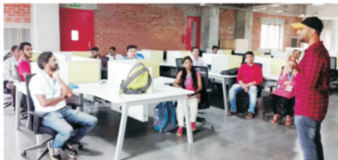
Trainees in an Interactive Session at Deshpande Startups, Hubli