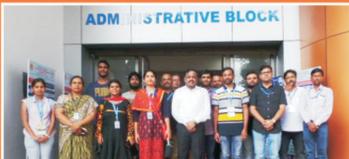
Visit to K-Tech Innovation Hub at KLE's Dr M S S College of Engg and Technology, Belgaum