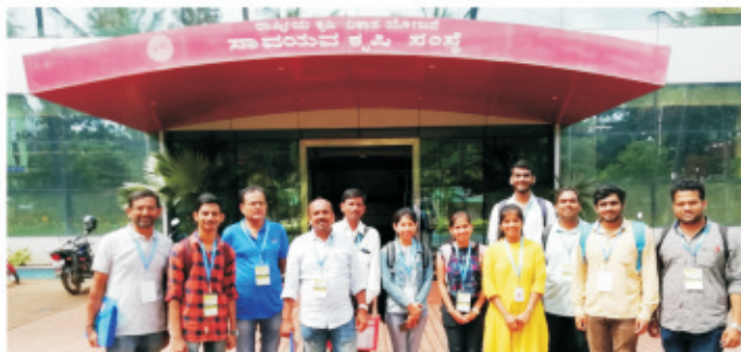
Anveshan Trainees at Institute of Organic Farming, UAS, Dharwad

The AOP trainees visited Institute of Organic Farming at UAS Dharwad, In an eye – opening interactive session with Head of the Institute, the trainees were benefited by better understanding of concepts, issues, methods, opportunities and challenges of organic farming in India. The business possibilities in the sector were also discussed.