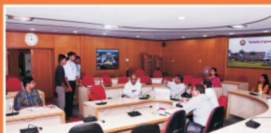
Screening of Applicants at CIC Meeting

Recruitment of Staff for Krishik-Agribusiness Incubator