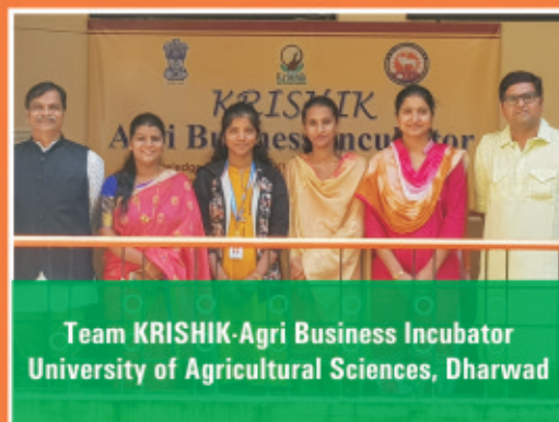
Team KRISHIK-Agri Business Incubator University of Agricultural Sciences, Dharwad