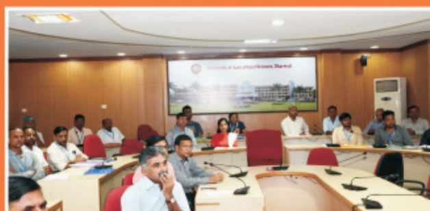
Applicants and Other Staff of UAS, Dharwad at Inauguration Program