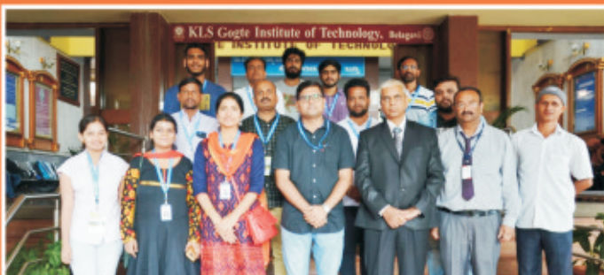
Visit to Gogte Institute of Technology, Belgaum

A visit was organised for the Anveshan trainees to NAIN Incubation Centre, Gogte Institute of Technology and K-tech Innovation Hub at KLE Institute, Belgaum on 4 Oct, 2019 to gain exposure to the facilities available at various incubation centres.