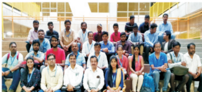
Trainees with KRISHIK-ABI Team at Deshpande Startups, Hubli

A three day workshop was organised for the trainees from 16-18th Oct, 2019 in Krishik-ABI. It included knowledge and skill building sessions, interactive sessions and visits to Deshpande Start-ups and CTIE, Hubli. As a significant step towards institutional strengthening, an MoU was signed between Deshpande Start-ups and University of Agricultural Sciences, Dharwad.