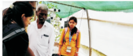
Anveshan Trainees visit to Hydroponic facility at Hi-Tech Horticulture Farm, Dharwad