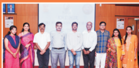
KRISHIK-ABI Team with CIC Members