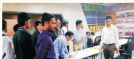
Trainees at 'Maker's Lab' in Deshpande Startups, Hubli