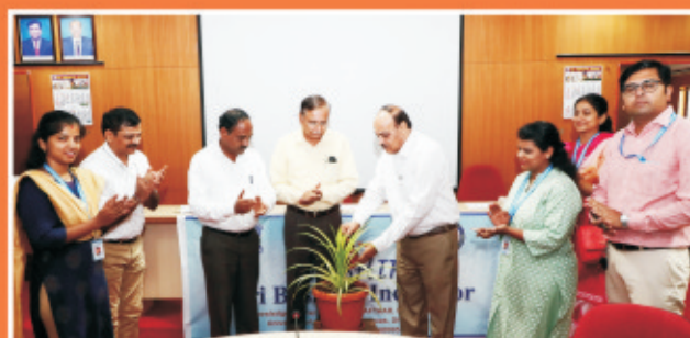
Inauguration of Anveshan and Avishkar Training Program