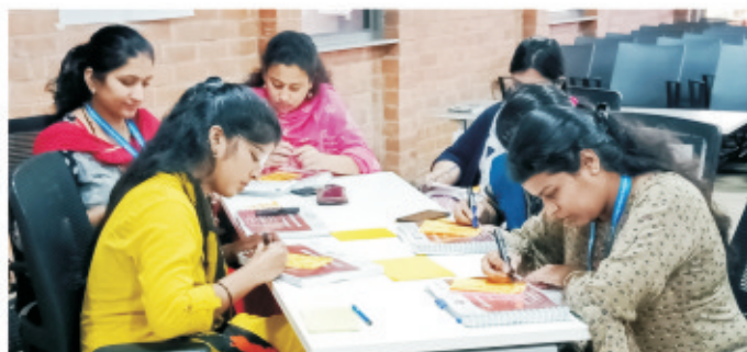
KRISHIK-ABI Team Engaged in Activity Based Learning at SEED Training Program