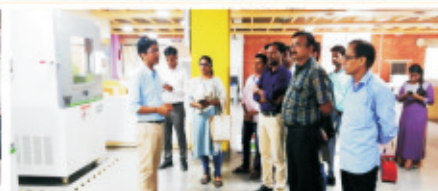
Trainees at ESDM Cluster and Testing Chambers in Deshpande Startups, Hubli