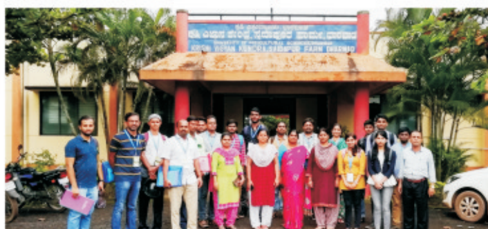
Anveshan Incubatees with KVK, Dharwad Staff

The AOP Trainees visited Krishi – Vigyan Kendra at Dharwad and were introduced to the concept of KVK, its main functions and activities. Within the KVK, the trainees were shown silviculture, goatary, poultry farms and integrated fisheries pond.