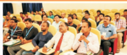
Trainees at Utkarsh Capacity Building Workshop attending a Session at UAS, Dharwad