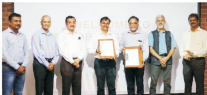
Exchanging MoU Between UAS Dharwad and Deshpande Startups, Hubli