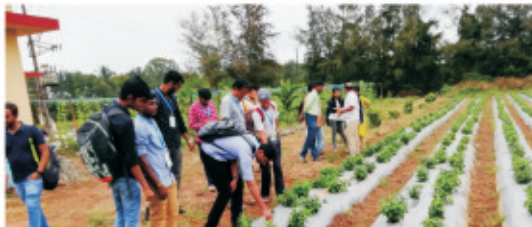
Anveshan Trainees Exploring Mulching of High Value Crops at Hi-Tech Horticulture Farm, UAS, Dharwad

A Visit to hi-tech horticulture farm was arranged for AOP trainees where they were practically exposed to methods of hi-tech cultivation such as floriculture using technology (mulches), controlled atmosphere polyhouses, Hydroponics etc.